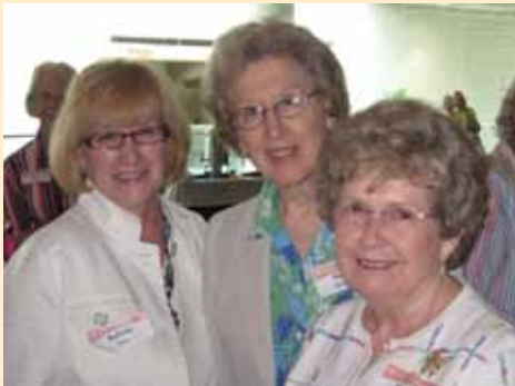
A few of the Wise Women enjoying this great event in 2010!

We live in a fast paced world with all kinds of stressors and little time for or attention to relaxation. We now know, however, a number of ways to meditate, image, visualize, move and eat to produce the benefits of relaxation, self awareness and self expression.