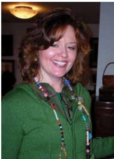
An example of a beaded strand.

Gather and bring to the program any old necklaces, bracelets, or earrings you no longer wear. Bring any old charms, buttons, crosses, coins, or shells that have significance to you. You're welcome to bring any purchased beads (we suggest large ones) and/or bring secondhand store jewelry, if you wish.