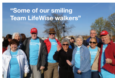
"Some of our smiling Team LifeWise walkers"