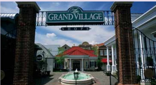
November 8-12, 2012 Branson Musical Holiday