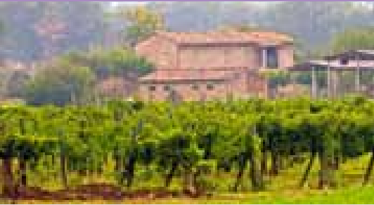
March 13-22, 2012 Discover Tuscany