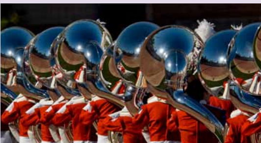
December 29, 2012 - January 2, 2013 Back by Popular Demand! California New Year's Getaway featuring the Tournament of Roses Parade