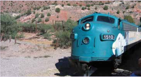
October 13-22, 2012 Trains & Canyons of the Southwest