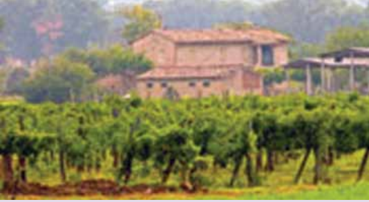
March 13-22, 2012 Discover Tuscany