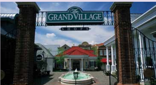
November 8-12, 2012 Branson Musical Holiday