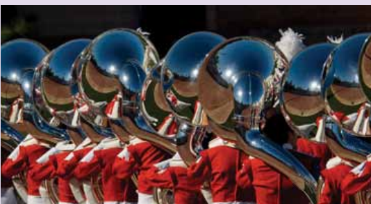
December 29, 2012 - January 2, 2013 Back by Popular Demand! California New Year's Getaway featuring the Tournament of Roses Parade